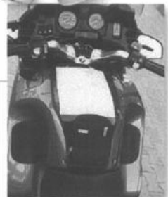
Map Pouch for Tank Top from RAD R1100RT & R1150T - Provides visible spot to secure your map. Has a small pocket for items. $99.95