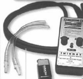
Twin max Sync Tool - Compact. Portable. Easy to use. $89.95