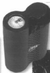
Air Compressor, Mini, Powered by Accessory Outlet - $19.95