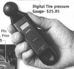
Digital Tire pressure Gauge - $25.95