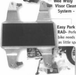
Easy Park from RAD - Perfect if your bike needs to take up as little space in the garage as possible. Rated up to 700 lbs. $229.95