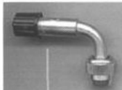
Angled Tire Valve Stem - Makes checking tire pressure much easier. $9.92