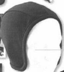
Cool Max Helmet Liner - Keeps your helmet clean. $14.95