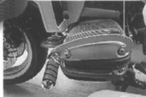
Footpeg & Mounts - Fits all R850, R1100, R1150. Price for one pair is $159.95