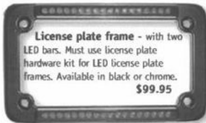
License plate frame - with two LED bars. Must use license plate hardware kit for LED license plate frames. Available in black or chrome. $99.95

The A&S BMW website. Over 6500 BMW motorcycle accessories, riders wear and lifestyle products on-line...all the time.