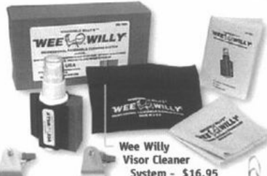
Wee Willy Visor Cleaner System - $16.95