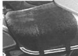
Sheepskin Seat Cover - Soft and insulating. $59.95