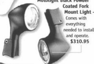
Motolight Black Powder Coated Fork Mount Light - Comes with everything needed to install and operate. $310.95