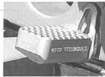
Oversized Brake Pedal K1200RS, R1100RS, R1100RT, R1150RT, R1150RS, R850 & 1100R- $59.95