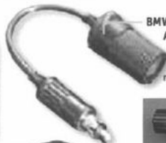
BMW Accessory Plug Adapter - Perfect for charging your cell phone on the road. $25.92