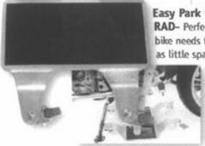
Easy Park from RAD - Perfect if your bike needs to take up as little space in the garage as possible. Rated up to 700 lbs. $229.95