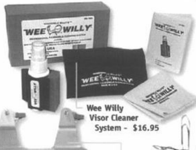
Wee Willy Visor Cleaner System - $16.95