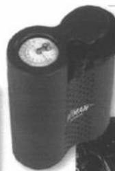
Air Compressor, Mini, Powered by Accessory Outlet - $19.95