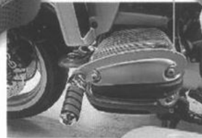
Footpeg & Mounts - Fits all R850, R1100, R1150. Price for one pair is $159.95