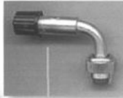
Angled Tire Valve Stem - Makes checking tire pressure much easier. $9.92