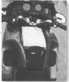
Map Pouch for Tank Top from RAD R1100RT & R1150T - Provides visible spot to secure your map. Has a small pocket for items. $99.95