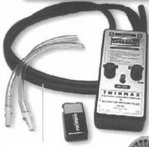
Twin max Sync Tool - Compact. Portable. Easy to use. $89.95