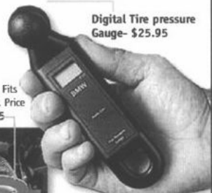
Digital Tire pressure Gauge - $25.95