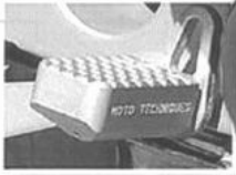
Oversized Brake Pedal K1200RS, R1100RS, R1100RT, R1150RT, R1150RS, R850 & 1100R- $59.95