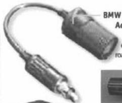
BMW Accessory Plug Adapter - Perfect for charging your cell phone on the road. $25.92