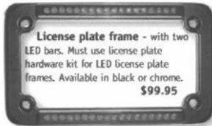
License plate frame - with two LED bars. Must use license plate hardware kit for LED license plate frames. Available in black or chrome. $99.95

The A&S BMW website. Over 6500 BMW motorcycle accessories, riders wear and lifestyle products on-line...all the time.