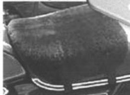
Sheepskin Seat Cover - Soft and insulating. $59.95