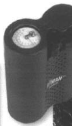
Air Compressor, Mini, Powered by Accessory Outlet - $19.95