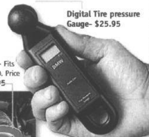
Digital Tire pressure Gauge - $25.95