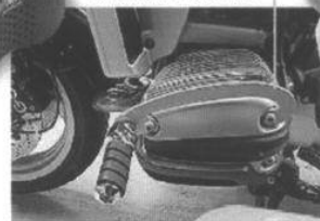
Footpeg & Mounts - Fits all R850, R1100, R1150. Price for one pair is $159.95