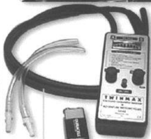
Twin max Sync Tool - Compact. Portable. Easy to use. $89.95