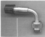
Angled Tire Valve Stem - Makes checking tire pressure much easier. $9.92