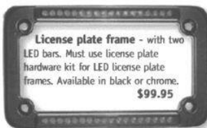
License plate frame - with two LED bars. Must use license plate hardware kit for LED license plate frames. Available in black or chrome. $99.95

The A&S BMW website. Over 6500 BMW motorcycle accessories, riders wear and lifestyle products on-line...all the time.