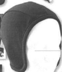
Cool Max Helmet Liner - Keeps your helmet clean. $14.95