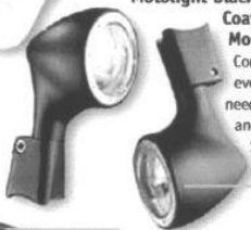
Motolight Black Powder Coated Fork Mount Light - Comes with everything needed to install and operate. $310.95