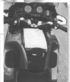
Map Pouch for Tank Top from RAD R1100RT & R1150T - Provides visible spot to secure your map. Has a small pocket for items. $99.95