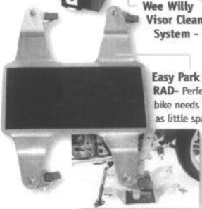
Easy Park from RAD - Perfect if your bike needs to take up as little space in the garage as possible. Rated up to 700 lbs. $229.95