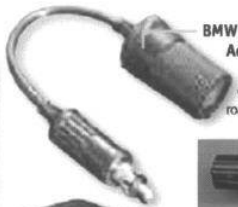
BMW Accessory Plug Adapter - Perfect for charging your cell phone on the road. $25.92