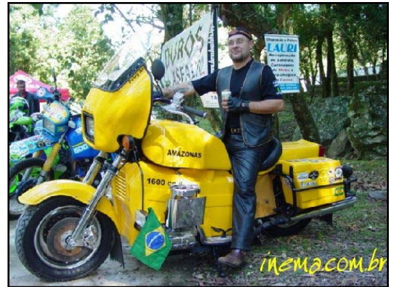
Brazilian made Amazonas motorcycle with a 1600cc air cooled VW 4 cyl. boxer motor.