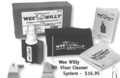
Wee Willy Visor Cleaner System - $16.95