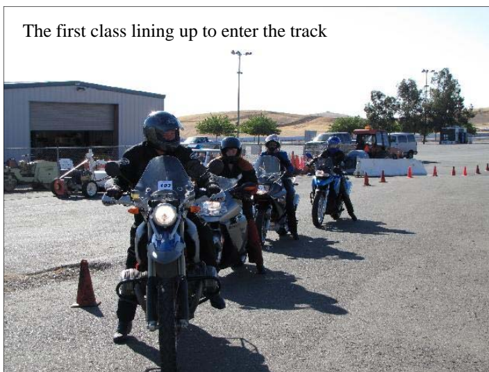
The first class lining up to enter the track

gone home. RCB received a dozen "Thank You" notes from participants – Newbies excitedly related