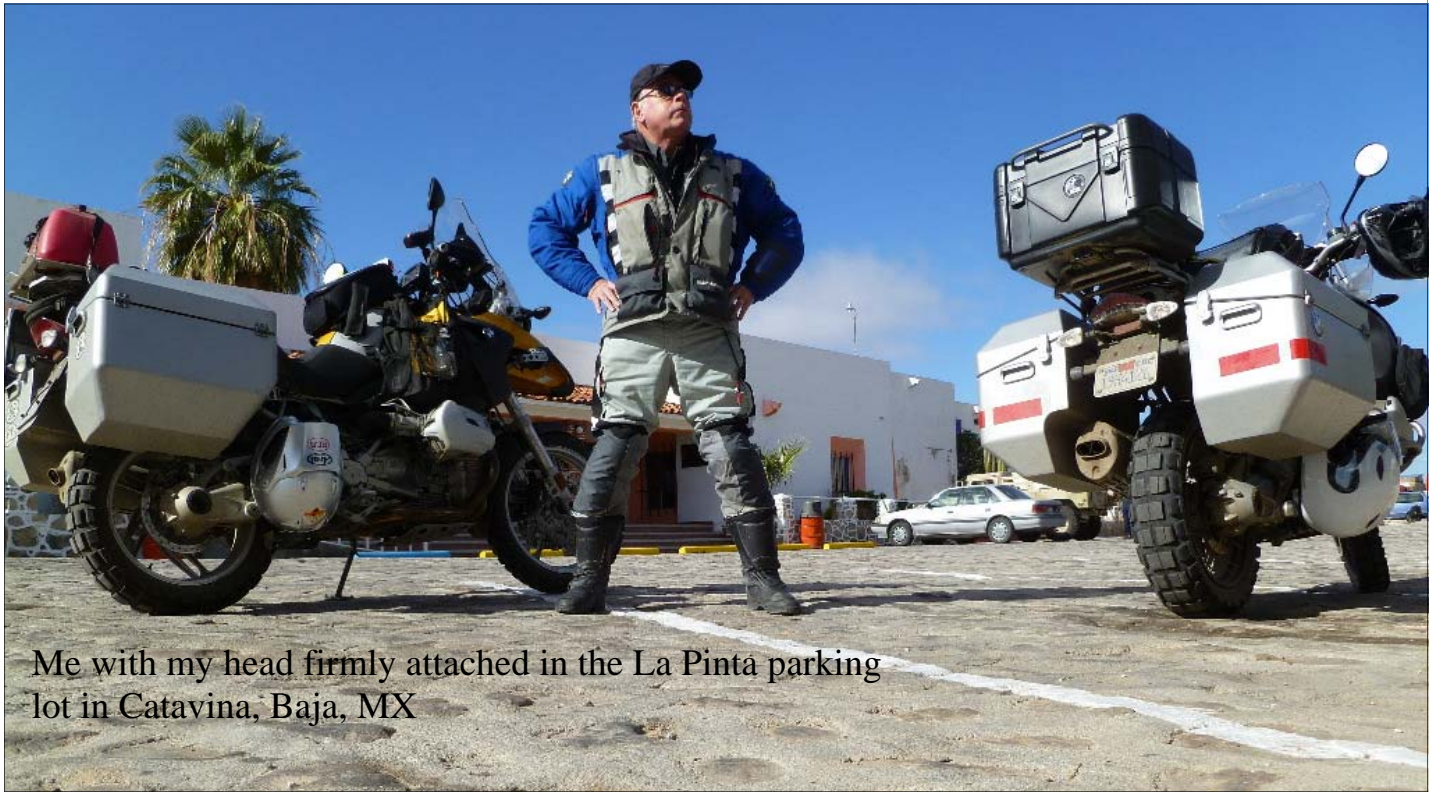
Me with my head firmly attached in the La Pinta parking lot in Catavina, Baja, MX

We stopped for the night in San Quintin at the former La Pinta Inn on the beach. It has since been sold and is called The Mission. The price was $48 for a very large room with two king size beds and a huge balcony overlooking the bay. The three of us shared the room to save money. Ear plugs were required since all three of us snore. WiFi was in the lobby so we could email our families back home and not spend the money to call by cell phone. I have AT&T and the Mexican rates are $1 per minute or 56 cents per minute with an International plan...not worth it.