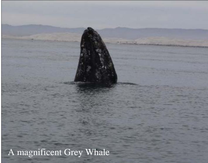
A magnificent Grey Whale