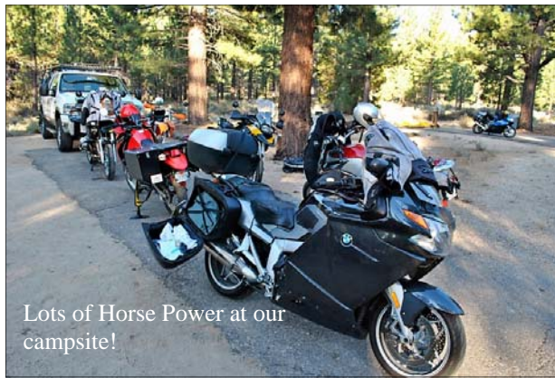
Lots of Horse Power at our campsite!