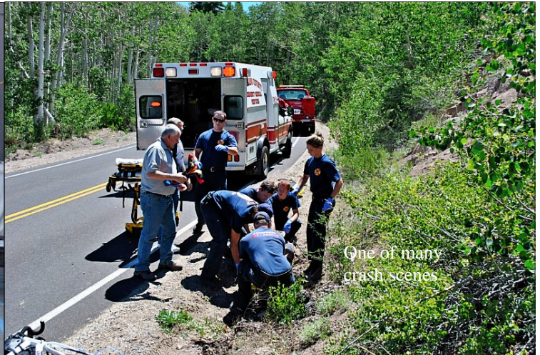
One of many crash scenes