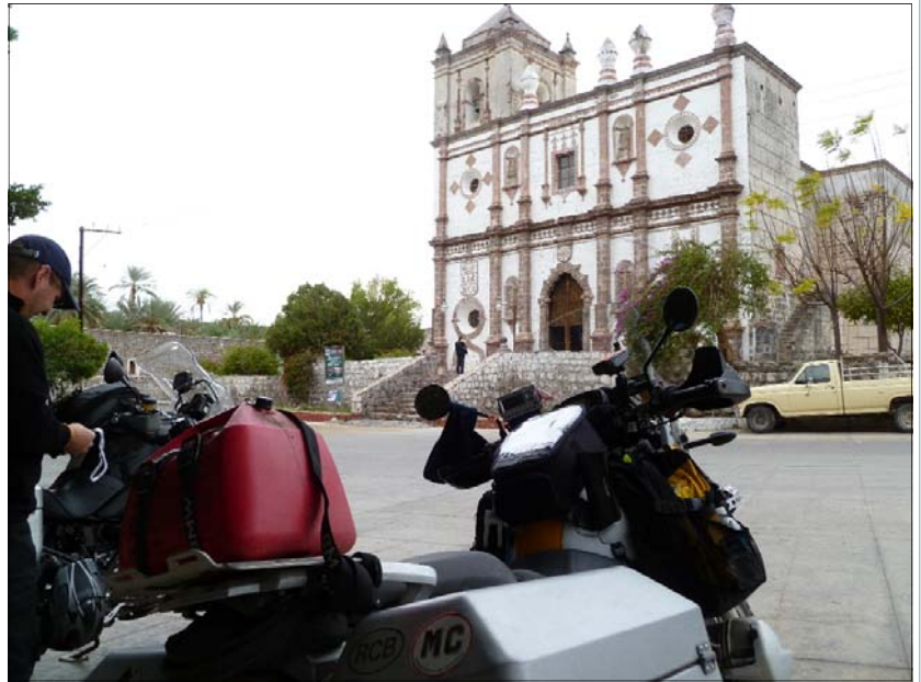
Taking a break next to the Cathedral in San Ignacio, Baja Sur, MX

River City Beemers, Inc. PO Box 2356 Fair Oaks, CA 95628 www.rcb.org