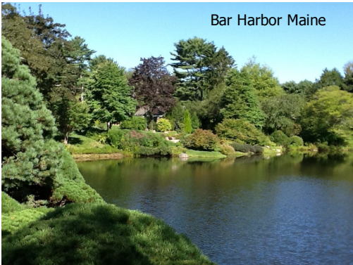
Bar Harbor Maine

and Jonesport, Maine. Neat little towns with working people trying to make a living. We had a opportunity to meet a sea captain in Bar Harbor, Maine. Spent some time talking to him about what he does and how he does it. Fascinating stuff! I didn't know that sea captains licenses are issued by the weight of the ship they run. This fellow ran a big motor launch up and down the Atlantic Coast for some wealthy owners. In the