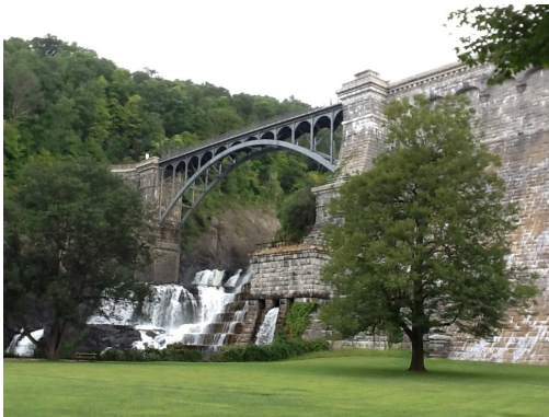
The New Croton Dam, part of the New York City water supply system, stretches across the Croton River near Croton-on-Hudson, New York, about 22 miles (35 km) north of New York City. Construction began in 1892 and was completed in 1906

than any of the others we were on across the country!! It certainly wasn't for road improvement!