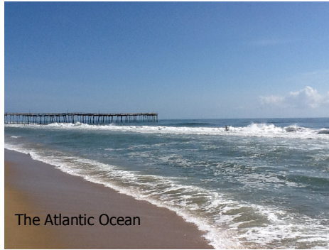
The Atlantic Ocean

We proceeded across NY, Vermont and New Hampshire to Maine. I had no idea of what to expect in Maine. From Google Maps it looks like a swamp. Riding through it it's a "green tunnel" meaning that with all the trees on each side of the road you can't see a thing. We decided to take small side trips to the coast and took the 10-12 mile side roads to the coast. In doing so, you find quaint little fishing villages such as Eastport