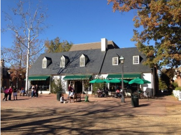
Williamsburg Historical old town.

And in the end, it's not the years in your life that count. It's the life in your years. - Abraham Lincoln