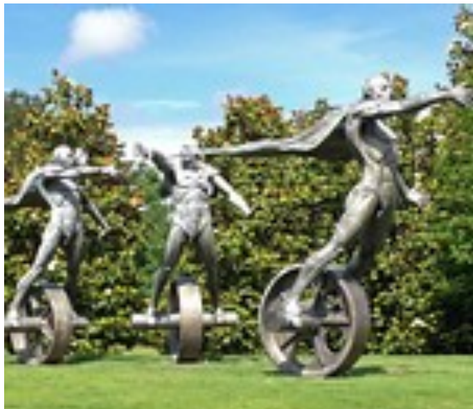
"The Chase" This sculpture, commissioned by the Barber Motorsports Museum, personifies the motion, strength and integrity that I associate with the racetrack and motorsports competition. The over-life-sized scale of the figures indicates the super-human power and sense of achievement that one experiences on the track. The sculpture, made of cast stainless steel, took over a year to create. Each 3,000-pound figure was cast in 28 different pieces, welded together, ground out, and finished with a chemical patina. Ted Gall, April 2005