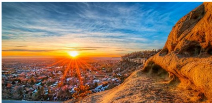
Be the Adventure in Billings

Whether you have a week or a weekend, there is an MOA event for you. Quickly navigate to each event for more info or to register. For a full list of rallies and events, visit our EVENTS CALENDAR .