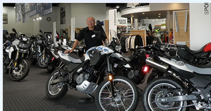
A&S BMW Motorcycles, 1125 Orlando Avenue, Roseville California 95661