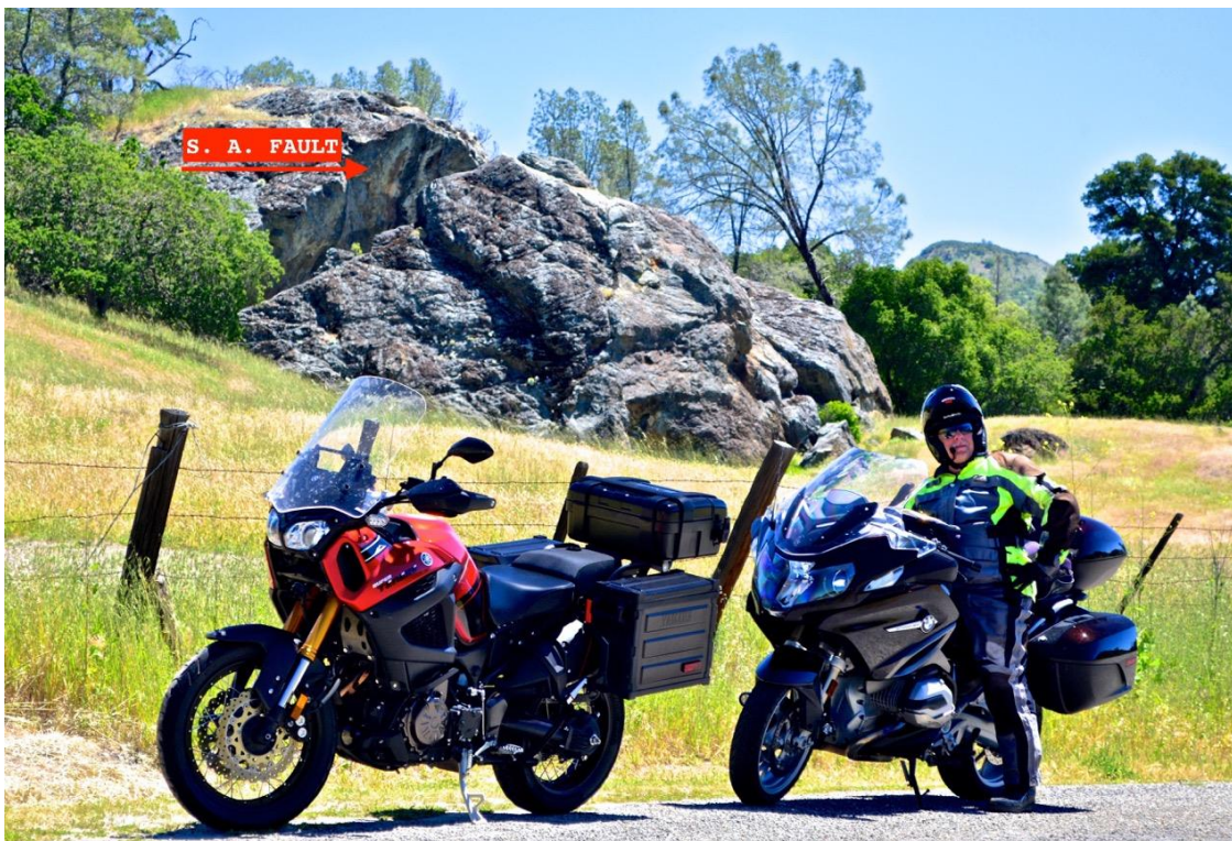
On Peach Tree Road to Hwy 25 heading up towards Hollister. At one point in the ride you cross over the San Andreas Fault where there is a high rock formation that was split in half because of the fault.