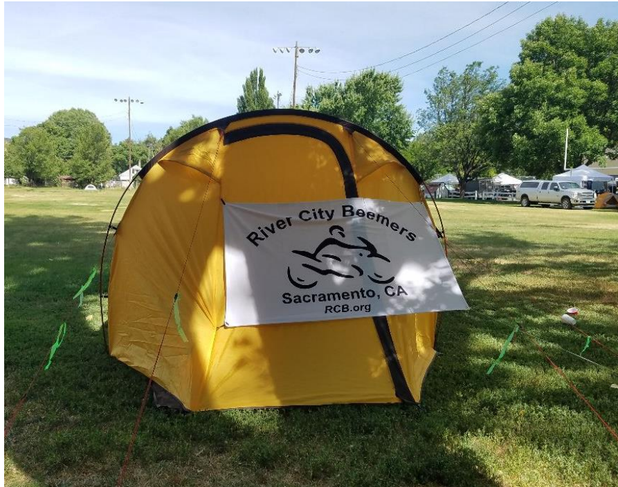
La Casa de Moseman