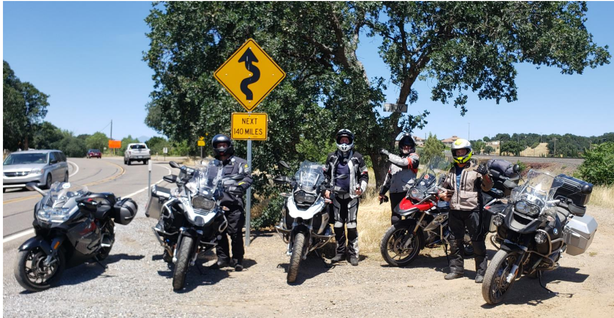
The riding to Lewiston is a bit boring as you can see from the warning sign.