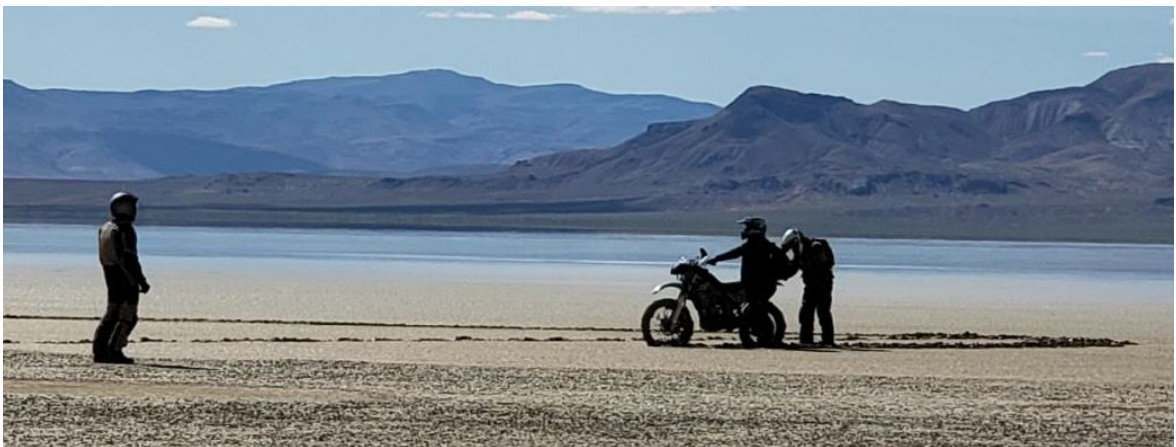
Yes, that is standing water in the background. A rare sight on The Playa.