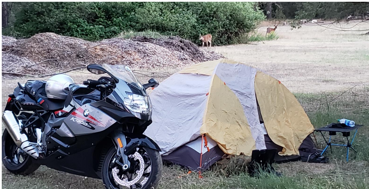
Visitors in the camp ground.