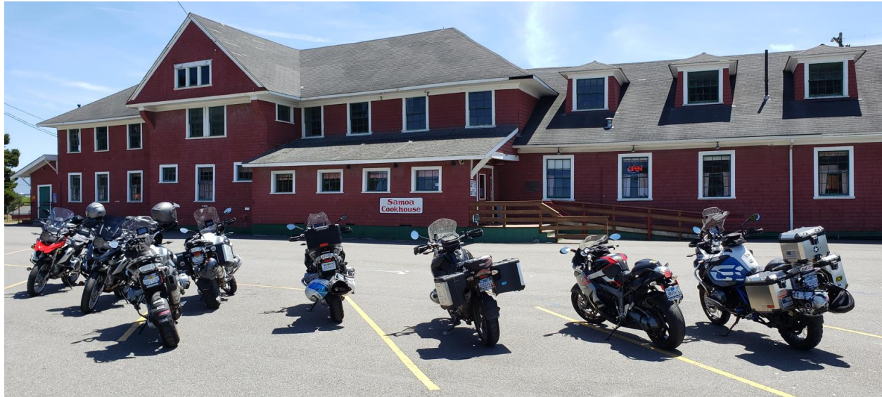
Lunch. Nom nom.