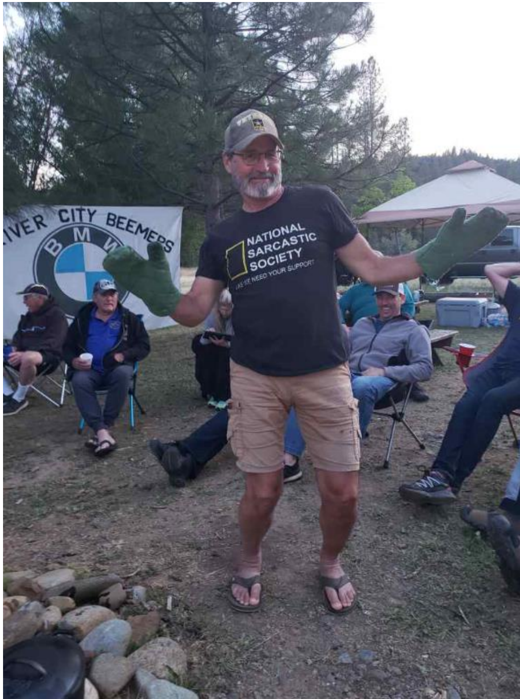
No words necessary, eh?