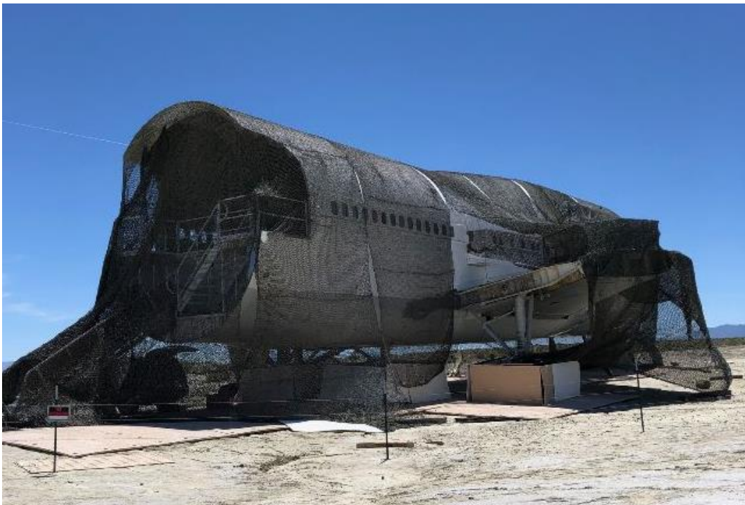
That is a Boeing 747 cut off about 20' aft of the wing.