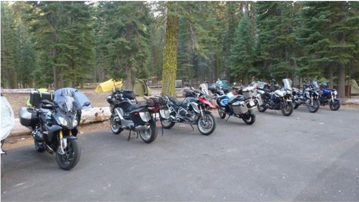
RCB Lassen Lost Creek Camping 2018

The camp site at the Lost Creek Group Campground for future reference.