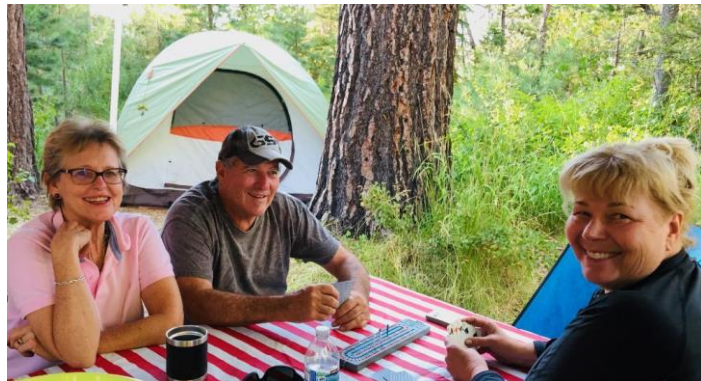
Cribbage at Tahoe Chill

The RCB board of directors meets monthly to review past activities and plan future events, taking into consideration member interest and cost. The meeting is open to all. While the meeting begins at 7:00 P.M., most directors gather earlier to have dinner.