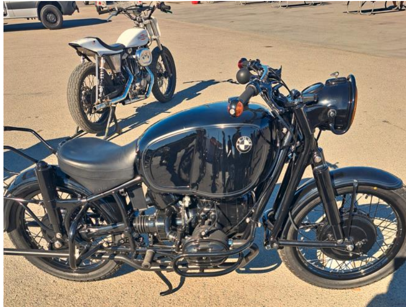
Not sure what this is.