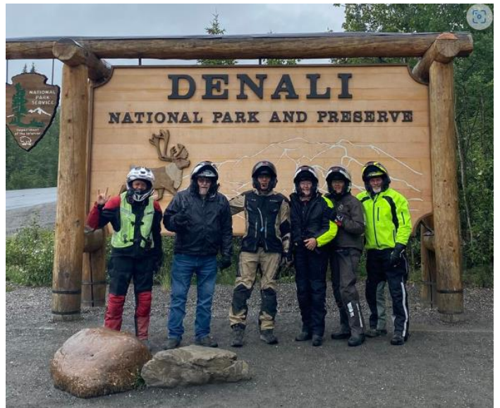
Teasers for next month.