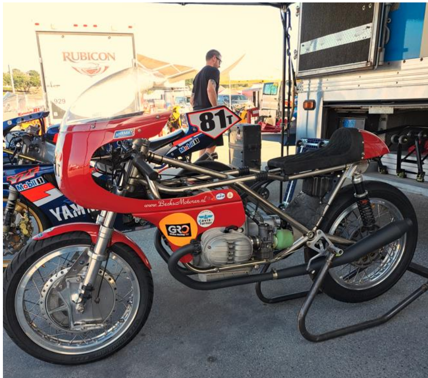
All custom made in Holland. The engine is a 500cc - 50's / 60's vintage. Work of art.