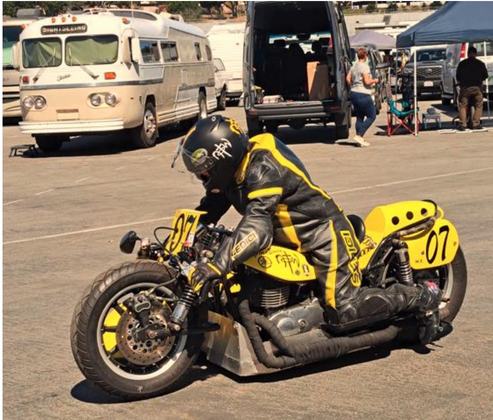
Yamaha 650 powered vintage sidecar