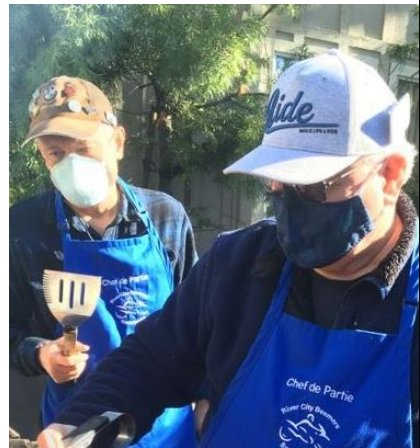
Children's Receiving Home BBQ