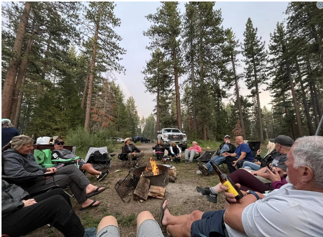
Campfire – First in Three Years